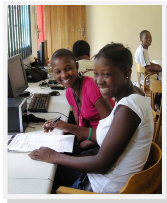
IT Centre Olievenhoutbosch, GP - 2009