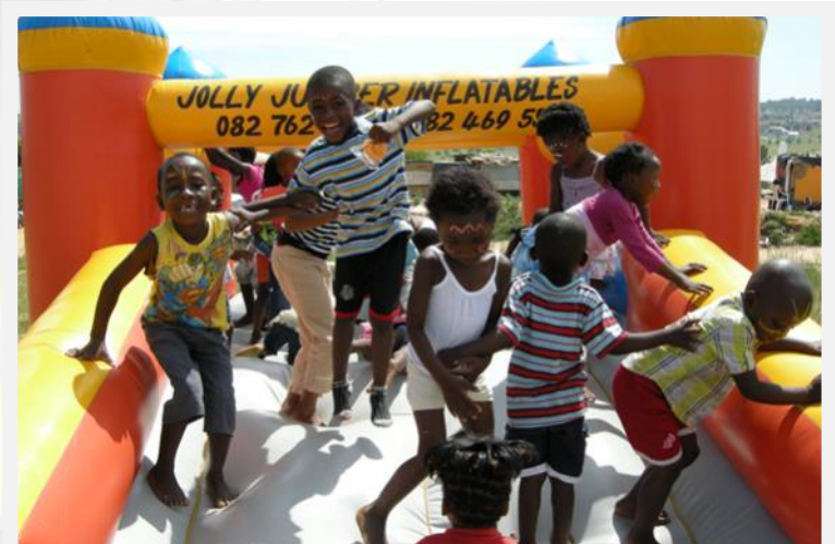
Riverbend Township Christmas Event