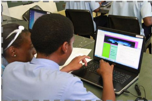
Awesome Impact at Web-Design BootCamp for 3 Highschools - Diepsloot 2014