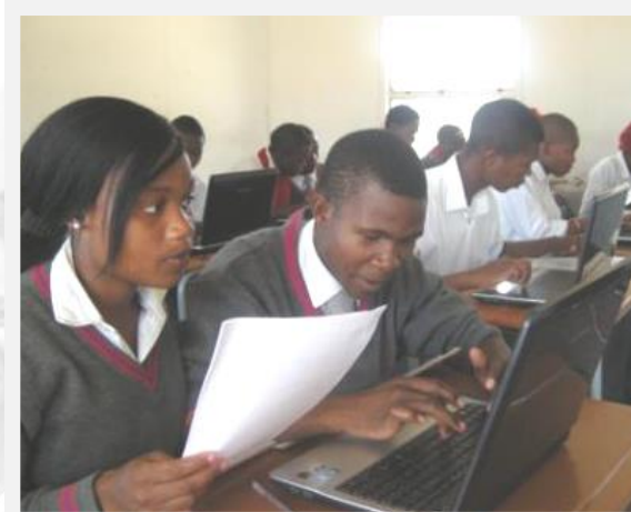
Rabasothe Combined School—Diepsloot

Youth with a clearer understanding of coding , its capabilities and the part it will play in their careers. Specifically, more youth who become drivers and enablers of these scarce skills within the country and continent.