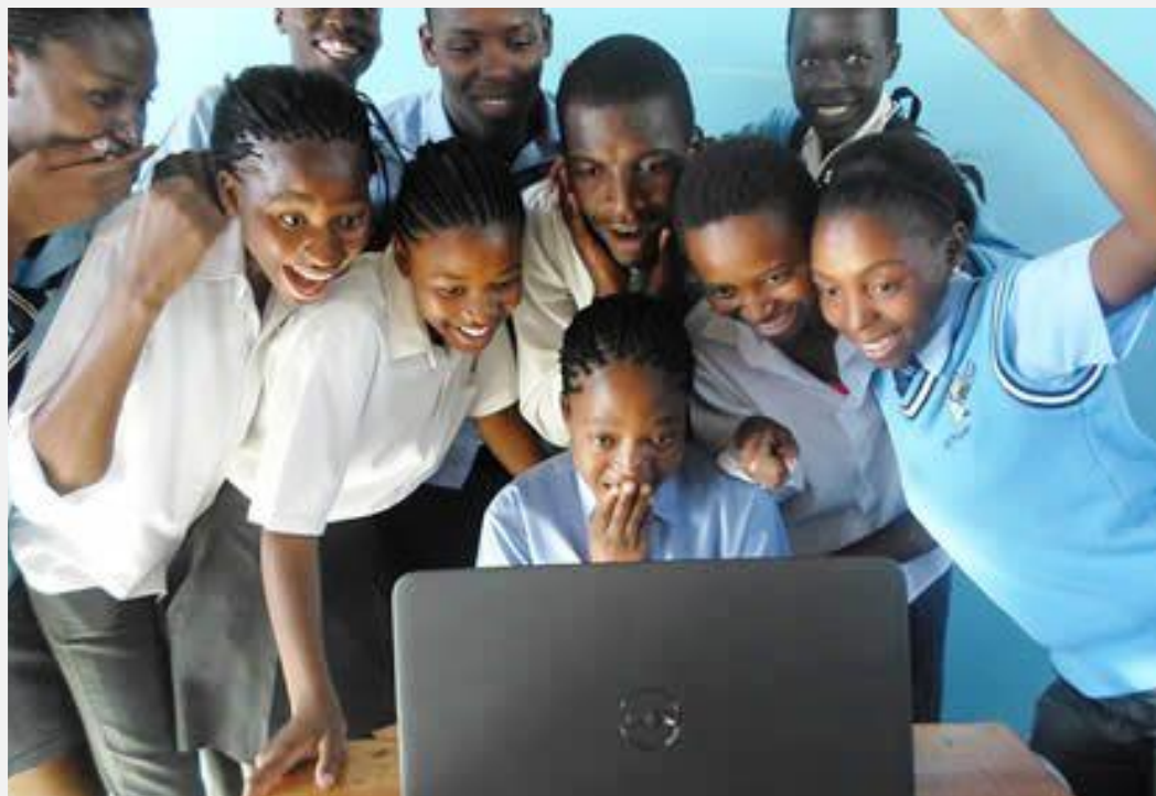
Awesome Impact at High School Workshops - Blue Eagle, Cosmo City 2014