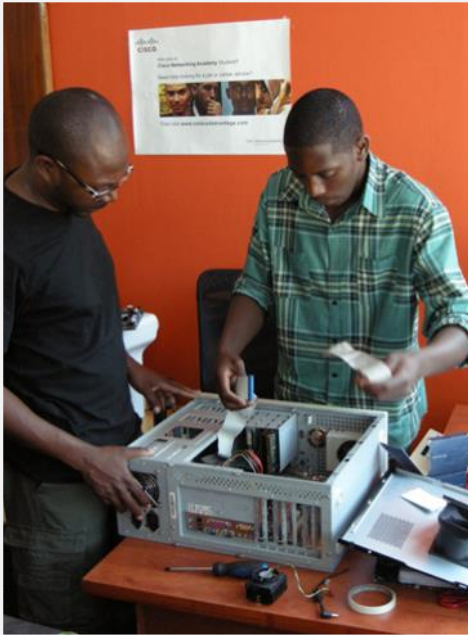
Practicals @ Midrand IT Center